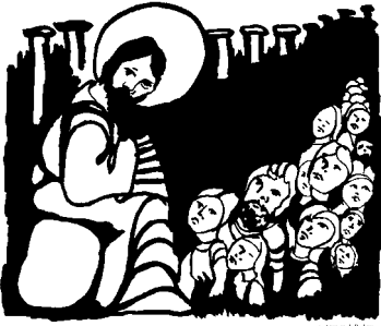
Jesus taught them as one having authority